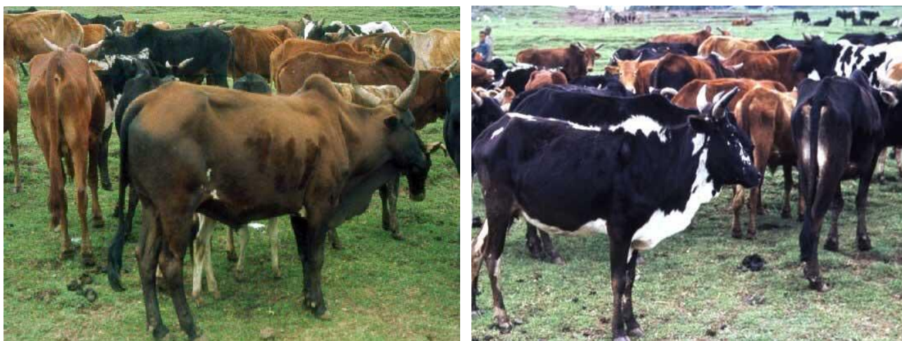
Figure 2. Description of Simada cattle breed

of its relatively smaller body size and lower market price for buyers. It is also known to have a short calving interval and low space requirement. However; the breed does not tolerate the heavy fly burden and the swampy grazing land of the area [7]. Primary features of the breed are small body size; its color varies from black, black with white spot, and red, but other colors and combinations (red, roan, black-and-white) are common; smooth hair, small or absent naval flap, horns are short to moderate in length; hump is small to medium in size; they are mainly used for draught, and milk yield is quite low [10].