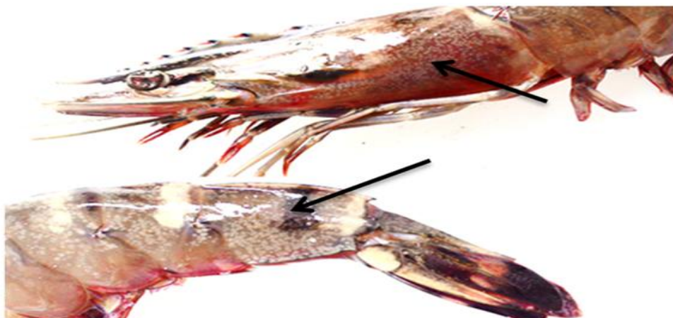
Figure 2. Samples of infected shrimp WSSV (black arrows indicated the patches of white spot signs of WSSV clinical symptoms).

After PCR testing on 50 samples of tiger shrimp taken from some tiger shrimp traditional farming in tarakan region during the period in January - March 2015 obtained four positive samples infected with WSSV which 2 samples have WSSV clinical symptoms such as white spots (Figure 2) and 2 samples without clinical symptoms. Positive samples then calculated and the prevalence of WSSV was obtained by 8%.