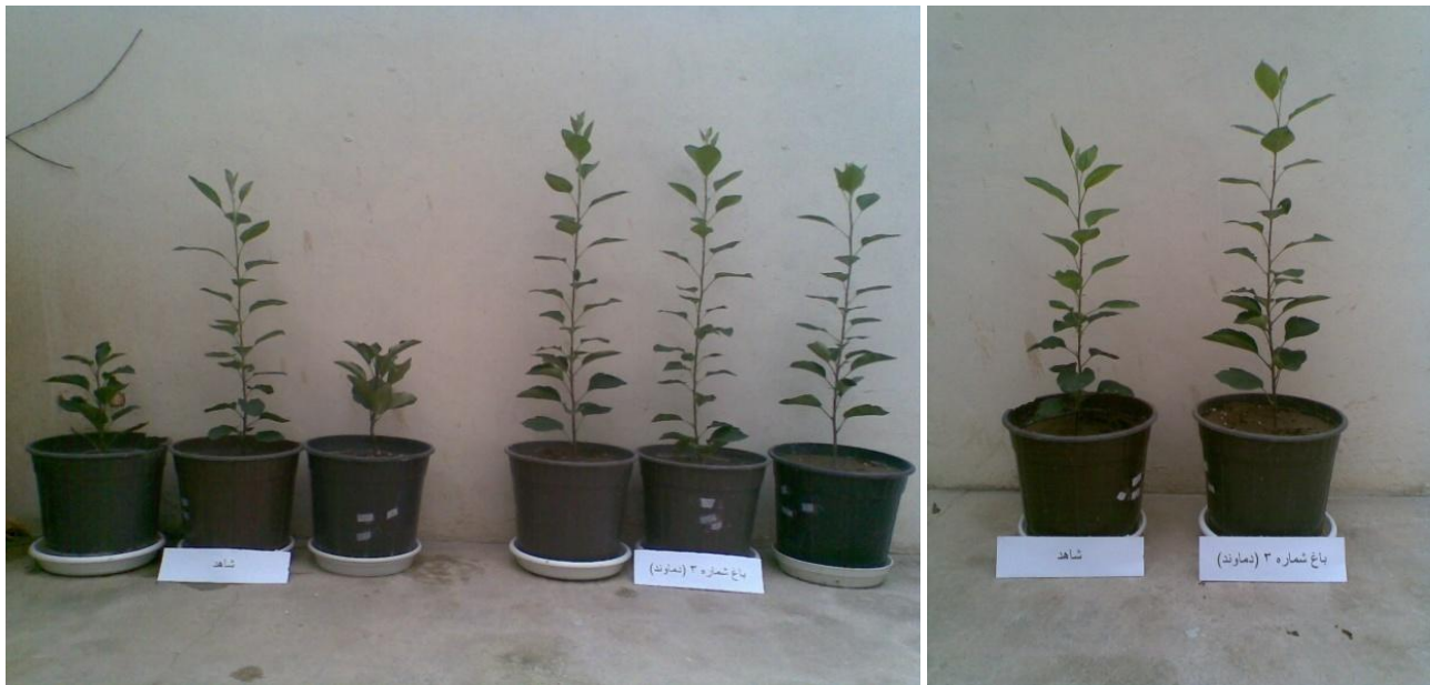
Figure 2. Seedlings length in control and mycorrhizal plants after 4 weeks of Mycorrhiza inoculation

All data from the trial were analyzed by ANOVA using the GLM procedure of SAS software [14], which was appropriate for a randomized complete block design. When significances were detected ( P < 0.05 ), values were compared post-hoc using the Duncan test. The results are expressed as averages and their Standard Error (SE).