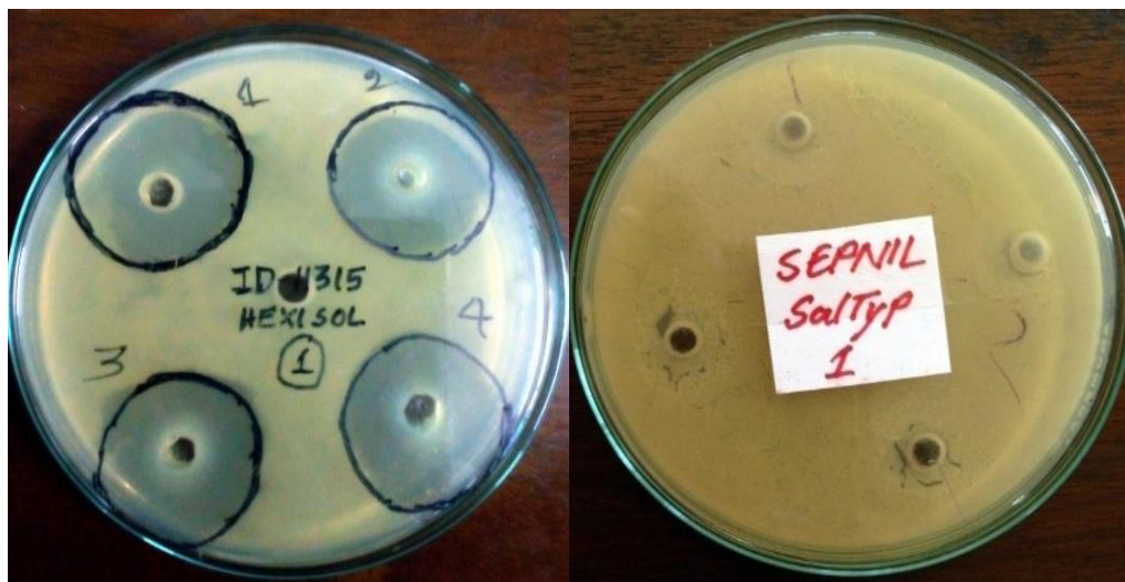
Figure 1. Sample MHA plate of Hexisol and Sepnil against S. flexneri and S. typhi respectively